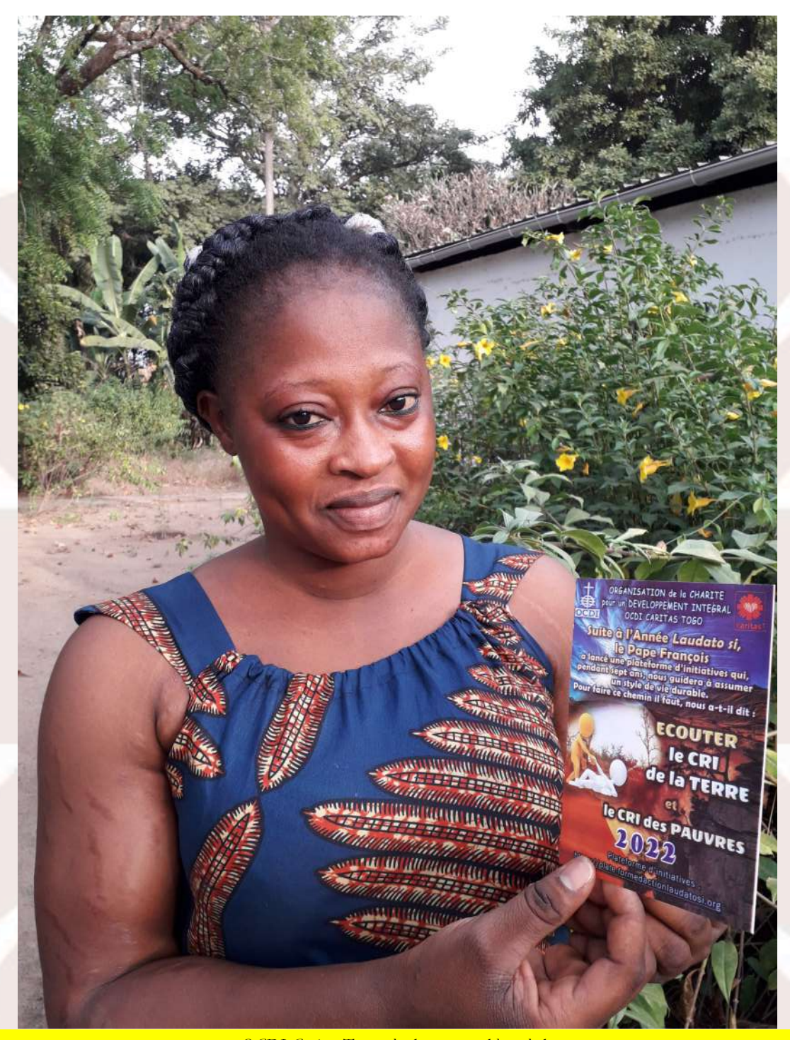
OCDI Caritas Togo calendar presented by a lady

In addition, as every year, a pocket calendar was prepared. It was sold in the parishes for the benefit of the OCDI's parish fund.