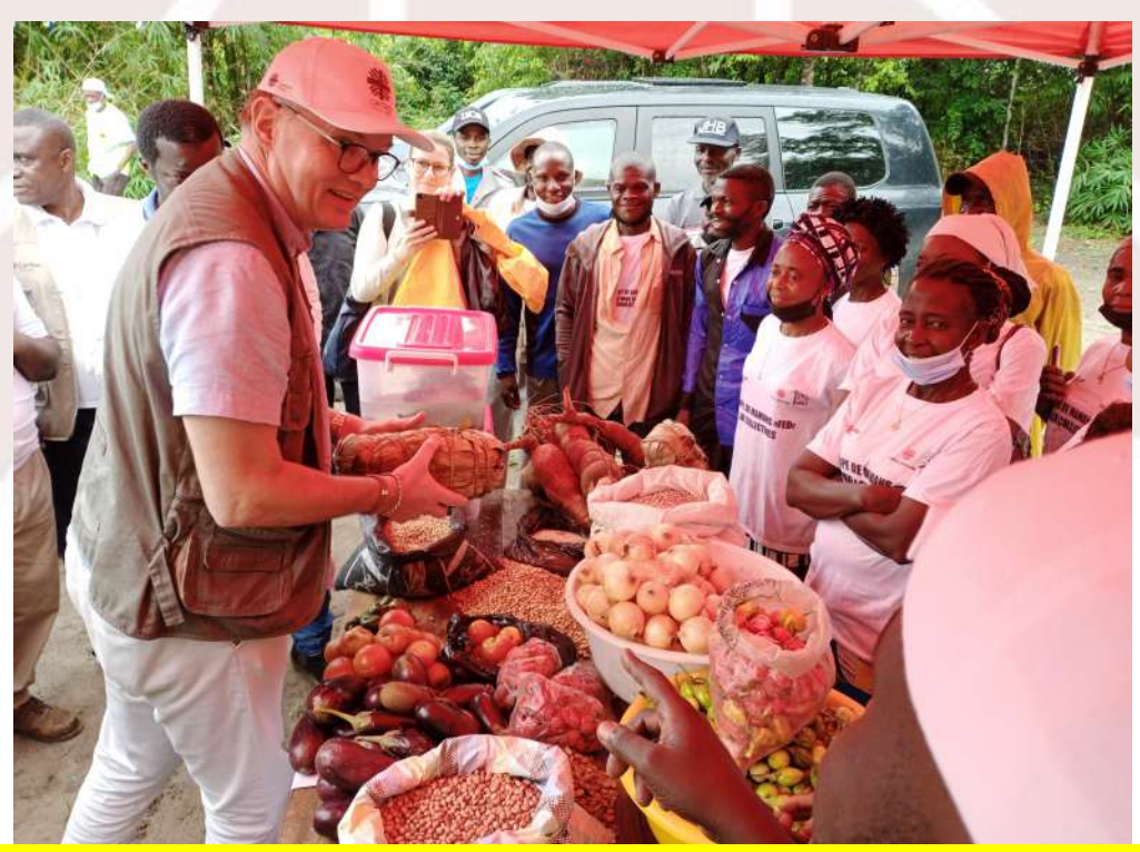
The ambassador visiting the exhibition stands of agricultural products

After greeting the Kasangulu authorities, the Ambassador and his entourage visited a stand displaying the beneficiaries' food products, before the presentation of a model hut garden to meet the personal needs of households without access to agricultural land. This was followed by a tour of fish ponds with a demonstration of artificial insemination of fish and the community reforestation site in the village of Selo, 62 km from Kinshasa. This sample confirmed the results and effects of the SECAL programme presented shortly before to the beneficiaries, three of whom happily testified to the impact of this programme on the improvement of their living conditions and their know-how.