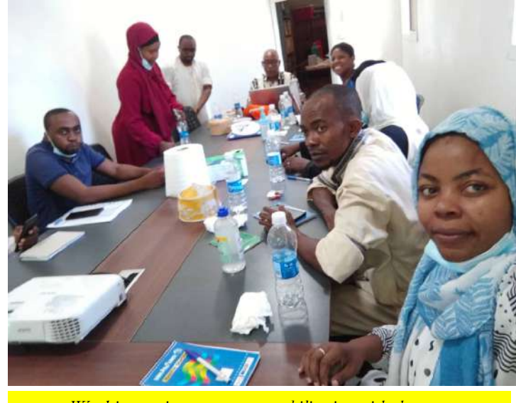
Working session on resource mobilisation with the team