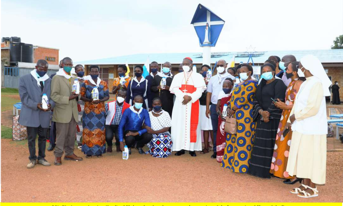
His Eminence Antoine Cardinal Kabamda after the mass on the occasion of the International Day of the Poor

He was addressing the congregation in Kibeho on 14 November 2021, after the mass celebrated on the occasion of the World Day of the Poor.