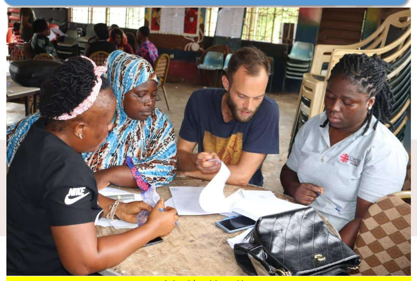
A view of the training participants

With financial support from Irish Aid through Trocaire on the project "Legal Aid Empowerment for marginalised women, girls, boys and men in the Western Rural District", Caritas Sierra Leone - Freetown management staff conducted a two-day training for 50 staff, volunteers and associates on Safeguarding policies and complaints handling mechanisms/procedures